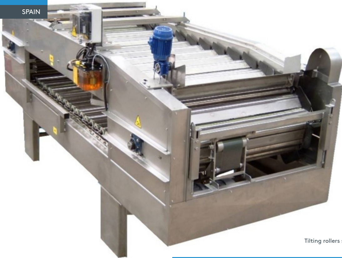
Tilting rollers sizer