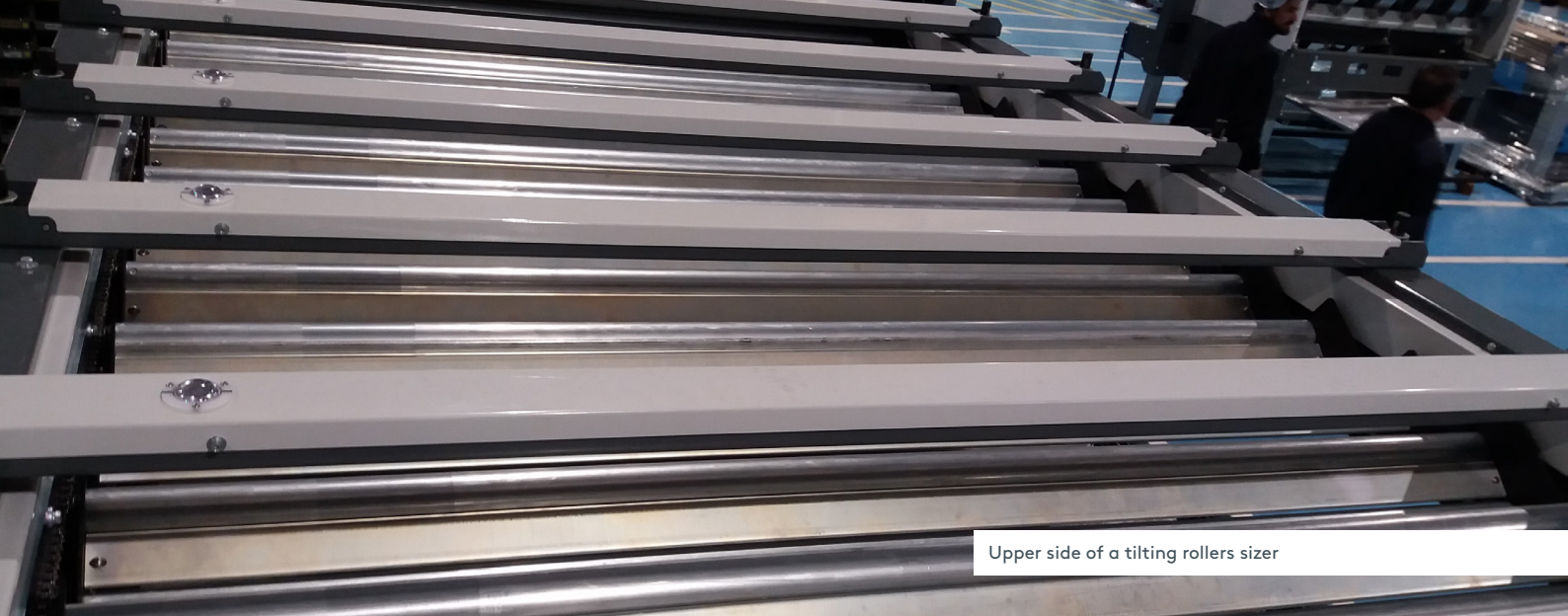
Upper side of a tilting rollers sizer