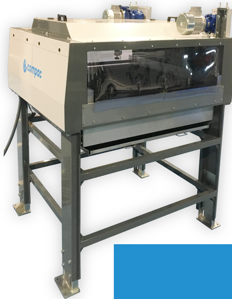
Wax/ fungicide applicator