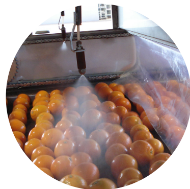
Product applicator in operation

Product applicator (0'37 KW), mixing tank (0'37 KW), by-pass lift system (1'13 KW)