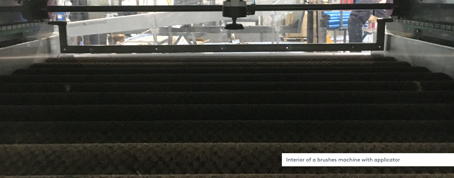
Interior of a brushes machine with applicator