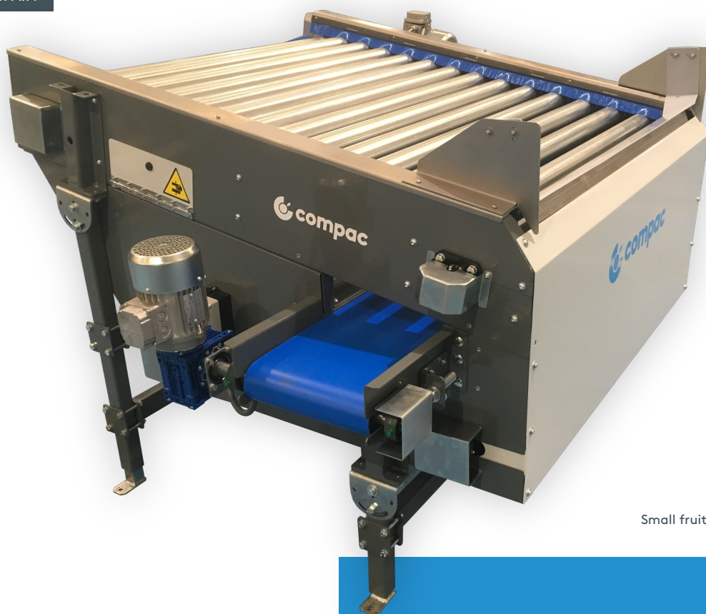
Small fruit eliminator