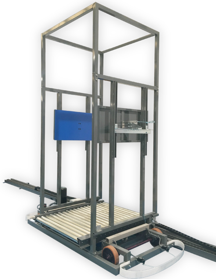
Full pallets trolley