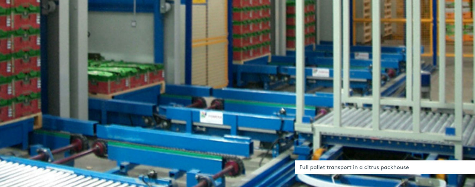
Full pallet transport in a citrus packhouse