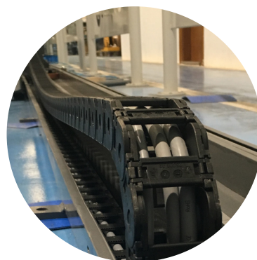
Detail of carriage guide for full pallets