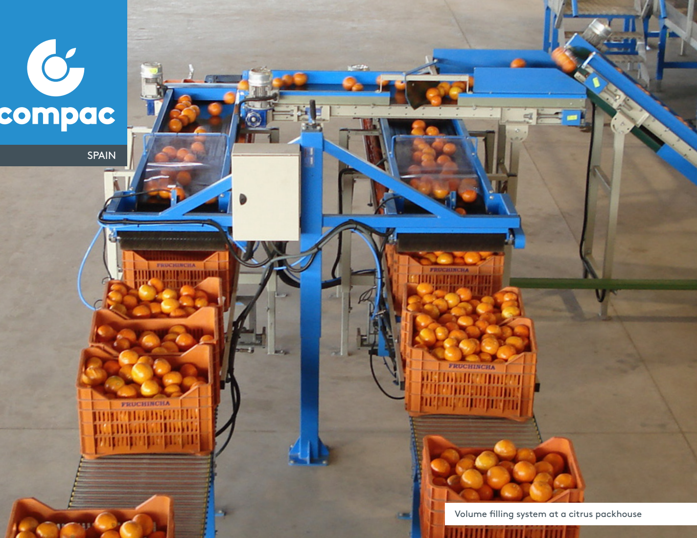
Volume filling system at a citrus packhouse