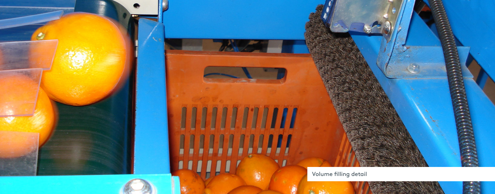
Volume filling detail