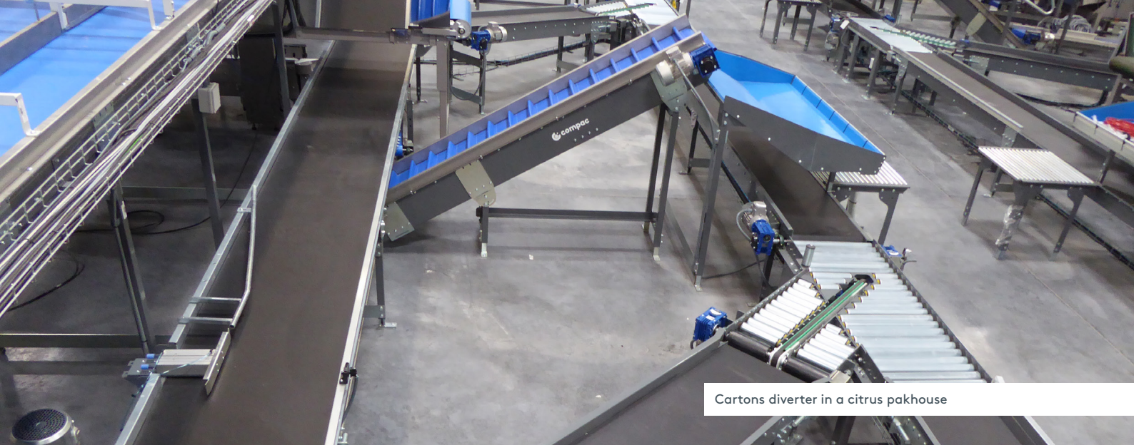
Cartons diverter in a citrus pakhouse