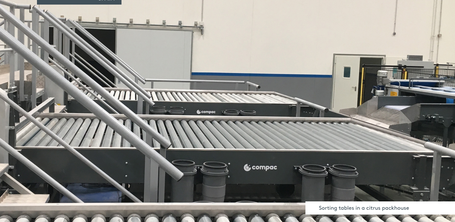
Sorting tables in a citrus packhouse