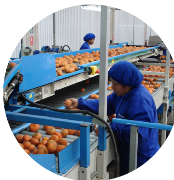
50% sorting table