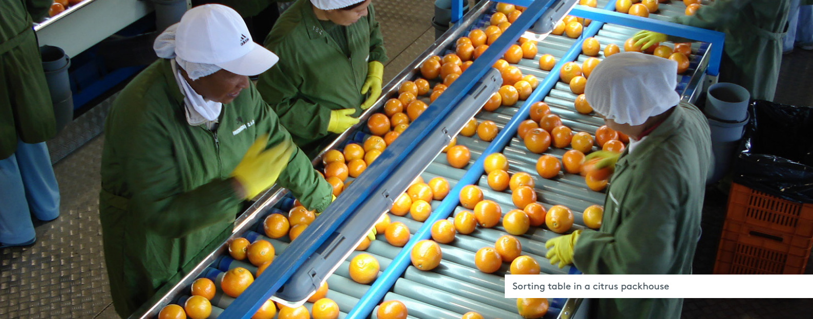
Sorting table in a citrus packhouse