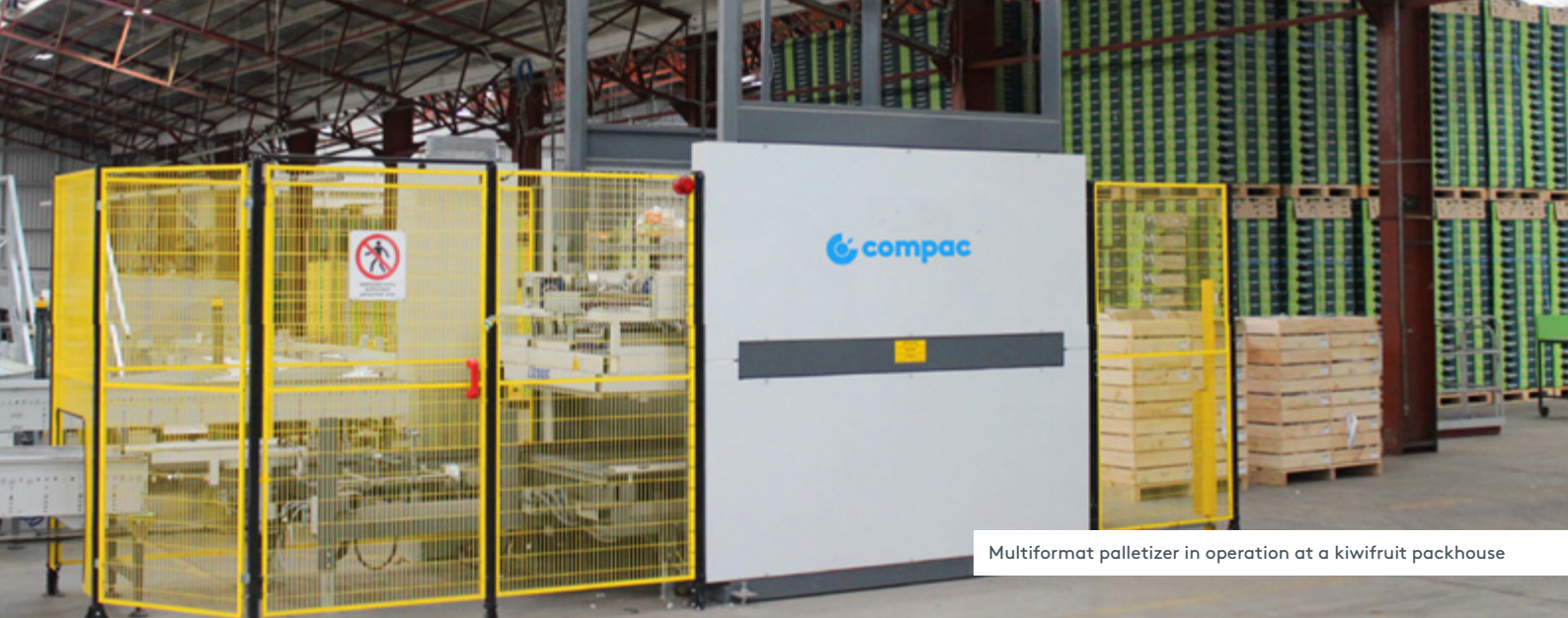
Multiformat palletizer in operation at a kiwifruit packhouse