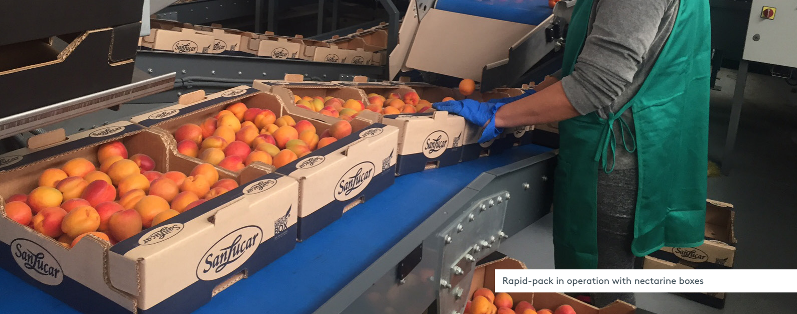
Rapid-pack in operation with nectarine boxes