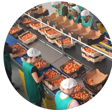
Upper central conveyor with side trays