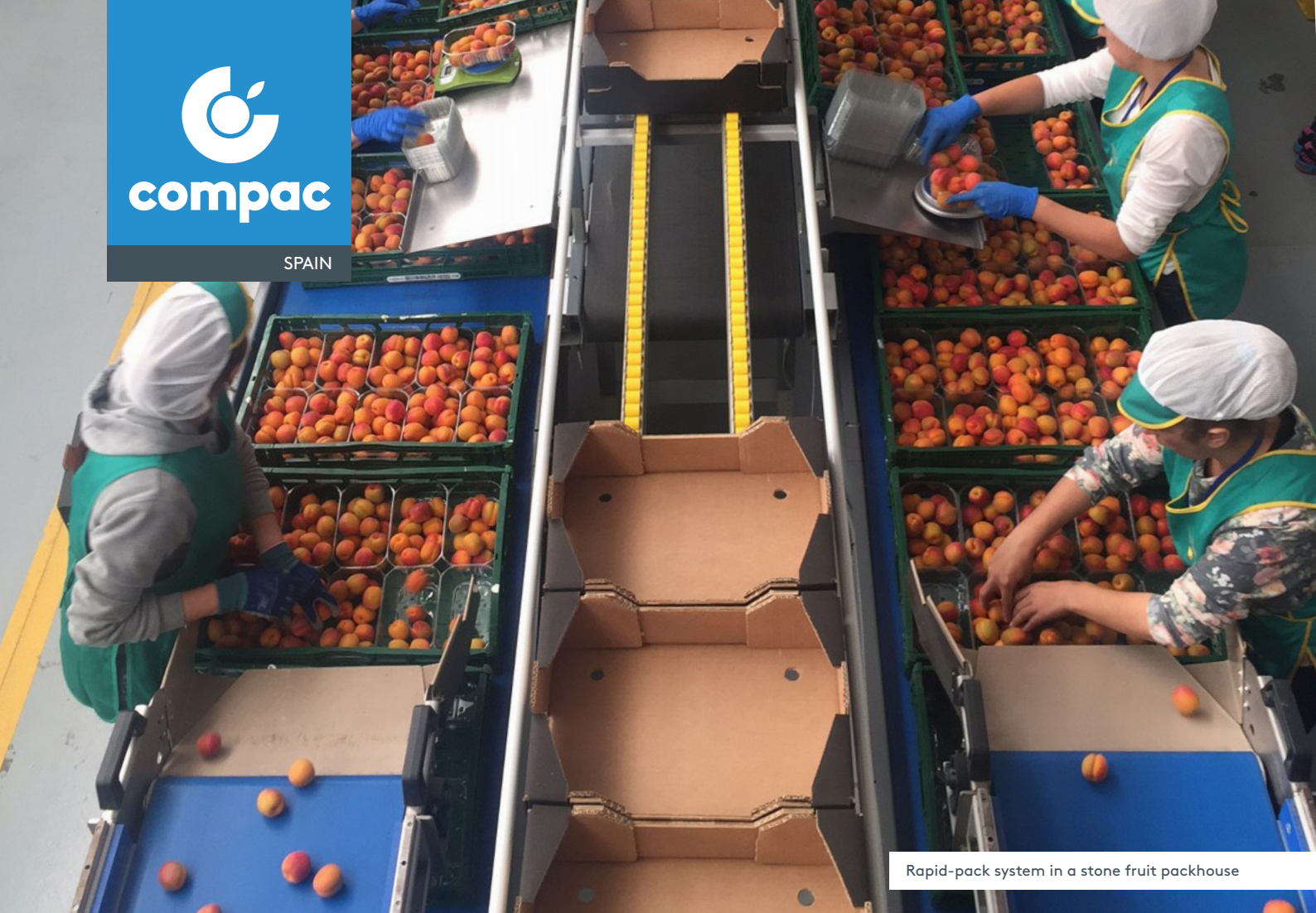
Rapid-pack system in a stone fruit packhouse