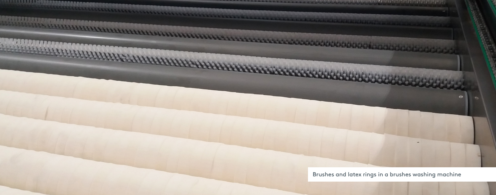
Brushes and latex rings in a brushes washing machine