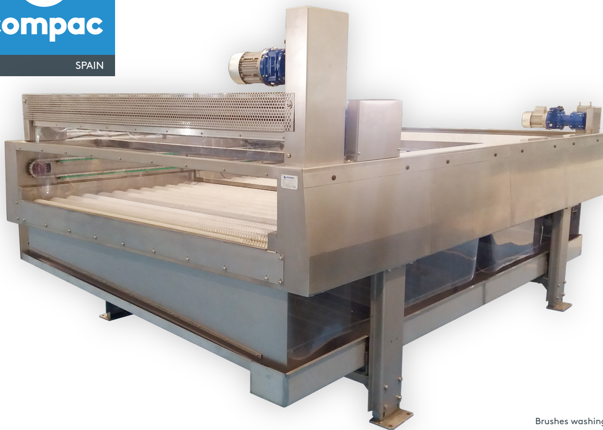
Brushes washing machine