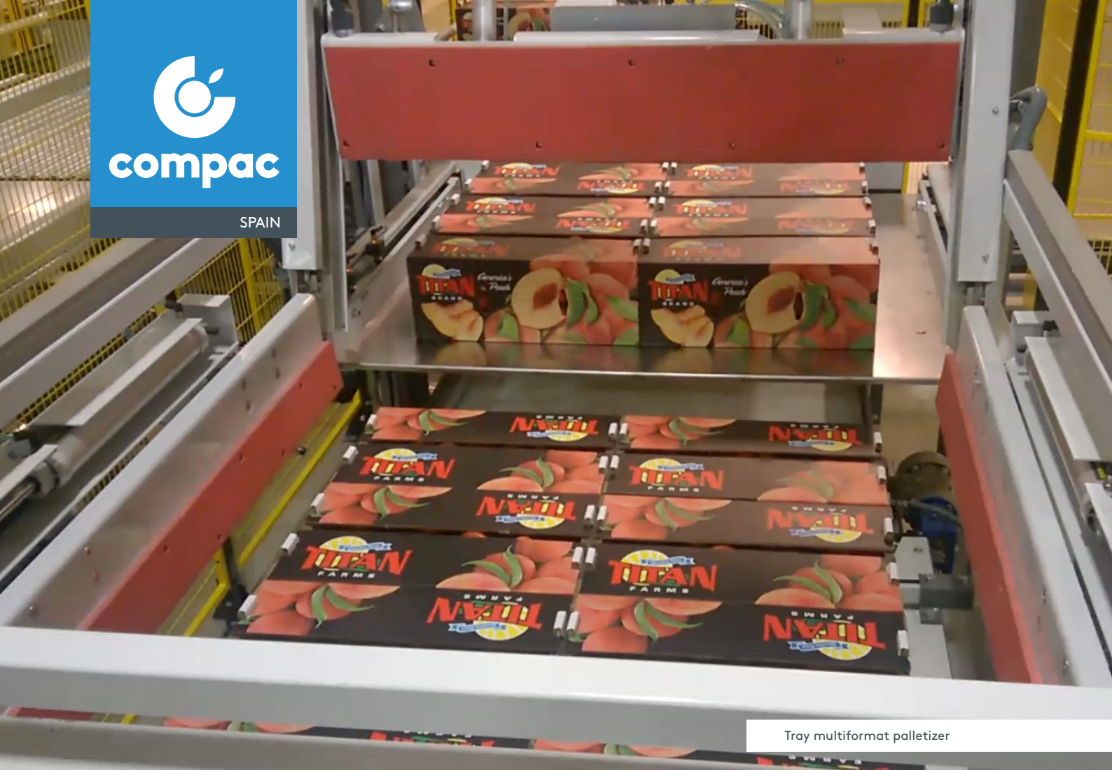
Tray multiformat palletizer