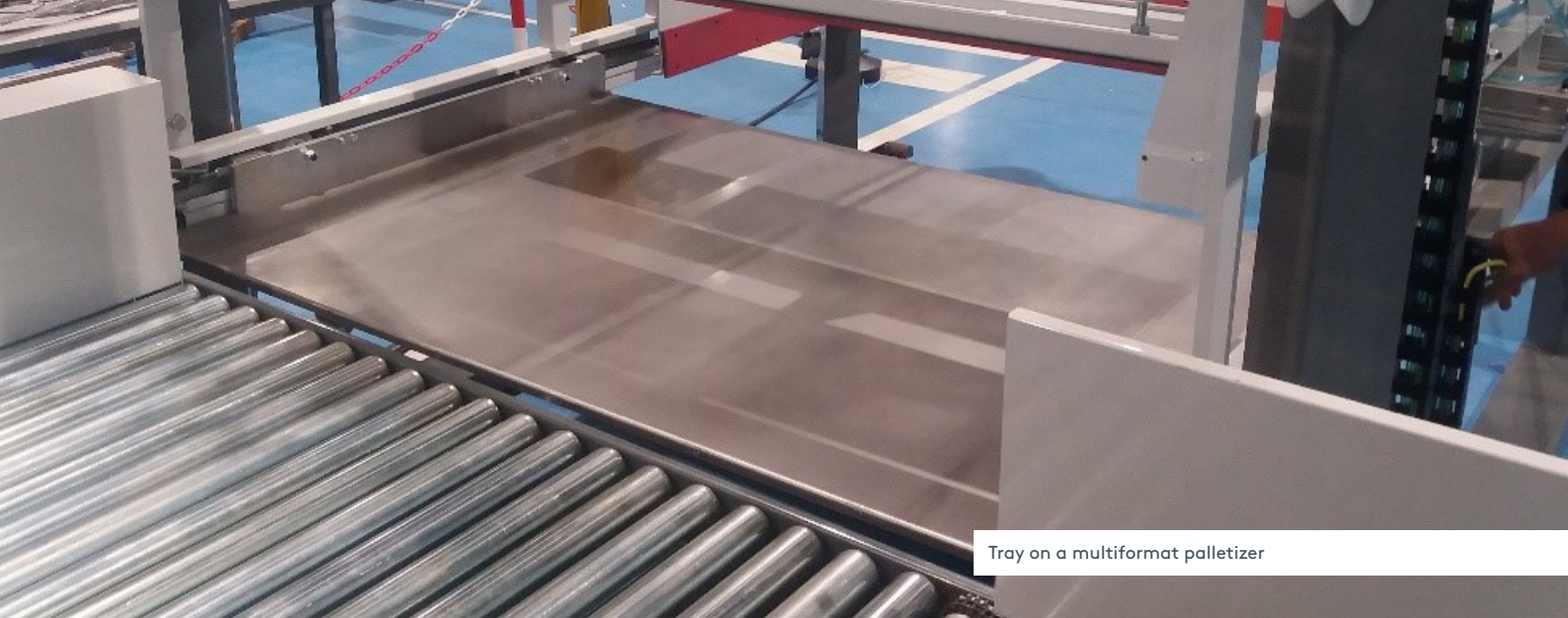
Tray on a multiformat palletizer