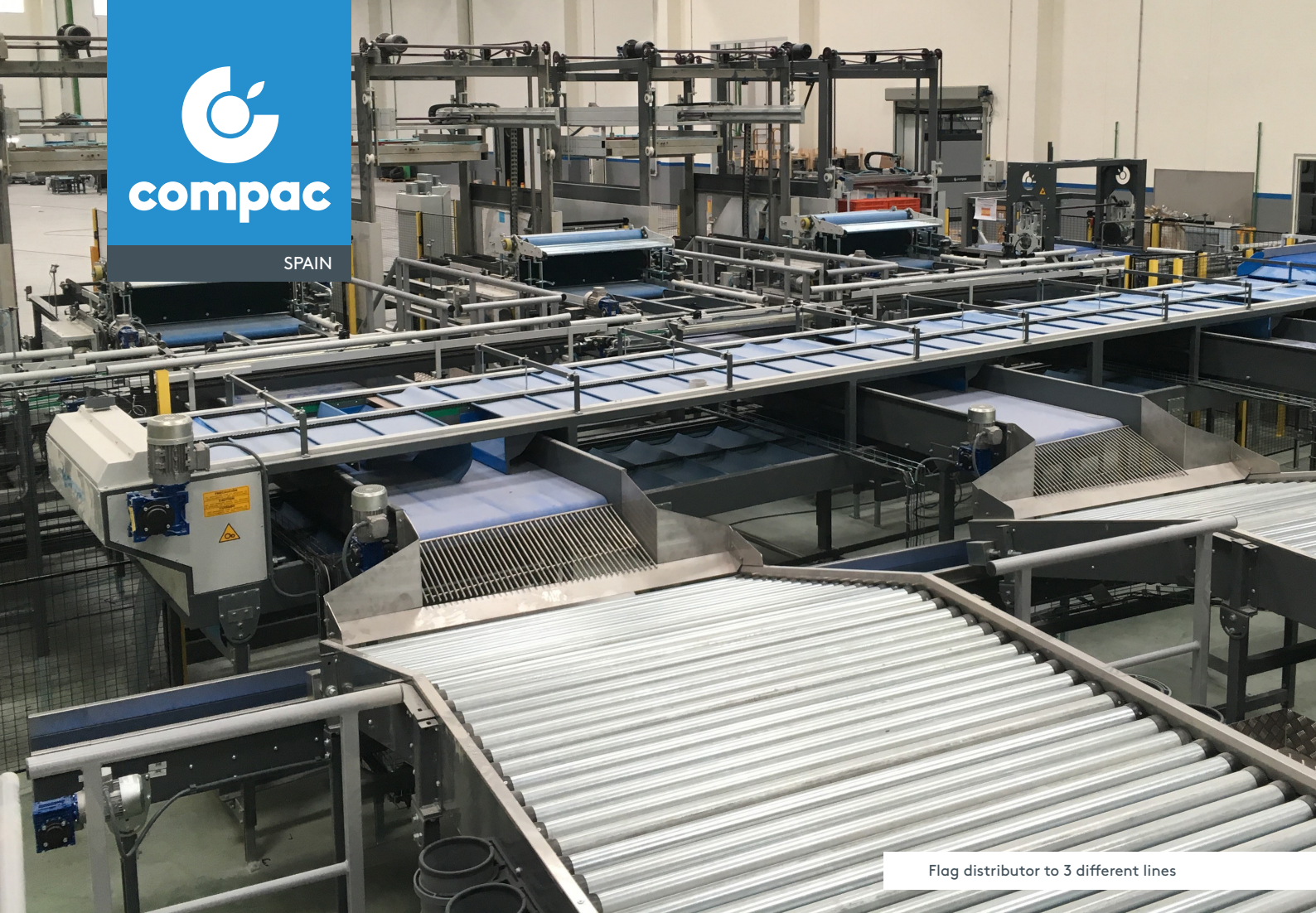
Flag distributor to 3 different lines