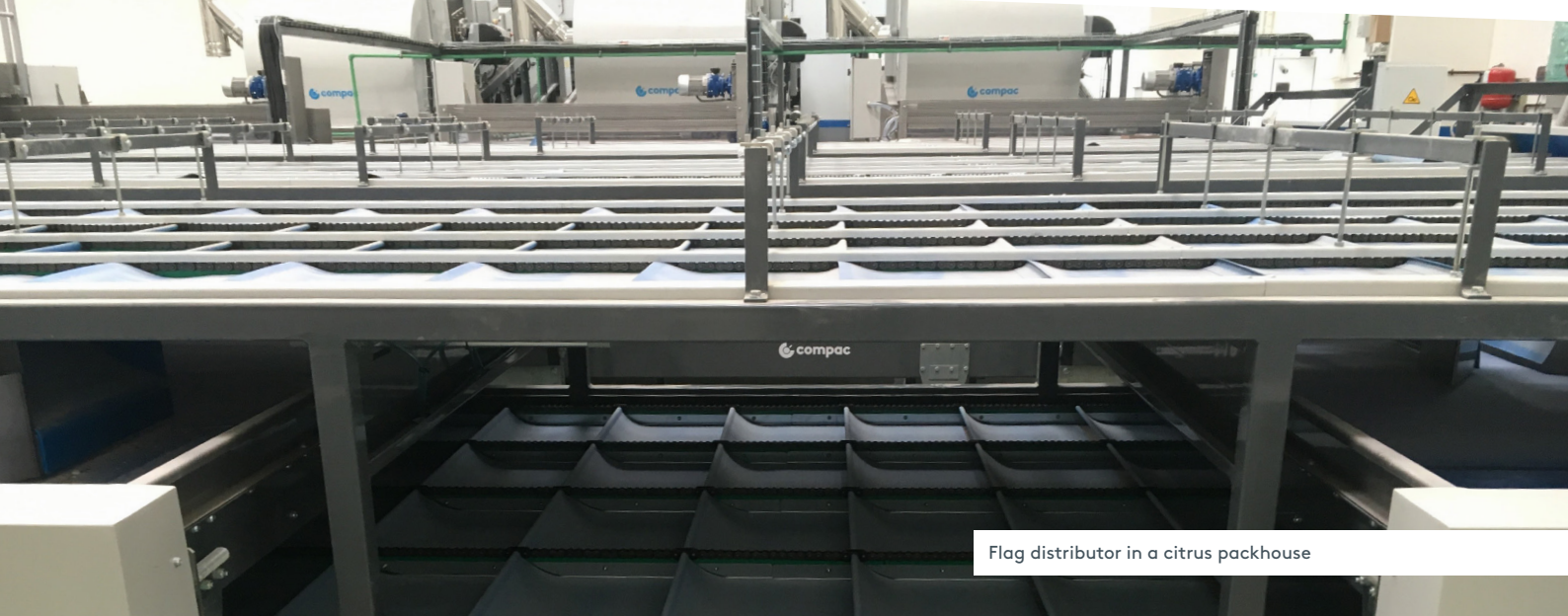
Flag distributor in a citrus packhouse